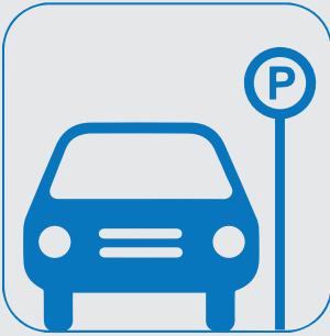
Free and Secure Car Parking