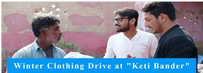
Winter Clothing Drive at "Keti Bander"