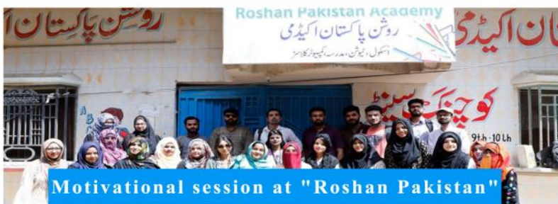
Motivational session at "Roshan Pakistan"