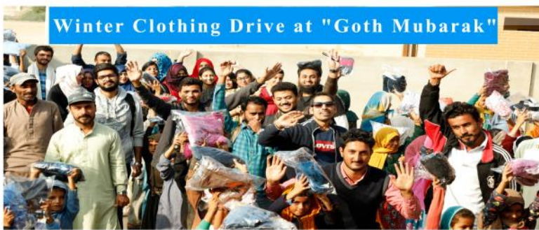
Winter Clothing Drive at "Goth Mubarak"

N UML Karachi has taken a dynamic and praiseworthy initiative by introducing different student societies that would conjure and enhance their hidden talents. The formed bodies include Drama and talent club, Model United Nation (MUN) club, Sports club, Green club, Social Welfare club, Readers' club, Writers' club, and Debate club.