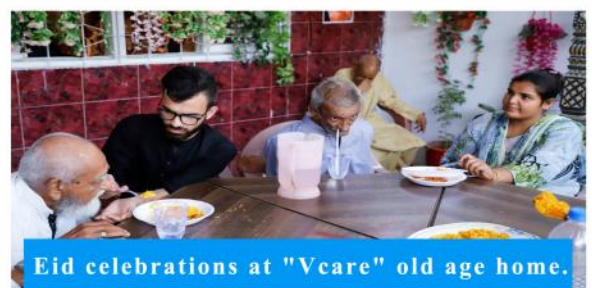
Eid celebrations at "Vcare" old age home.

The said clubs have their own organizational setup with a teacher assigned to supervise each. Meetings have been held to set each society in the right direction and some have even started work early such as the Social Welfare club, with their several welfare trips to schools and institutions. The Readers club has been discussing a popular book in each meeting. The event management society has had the credit of