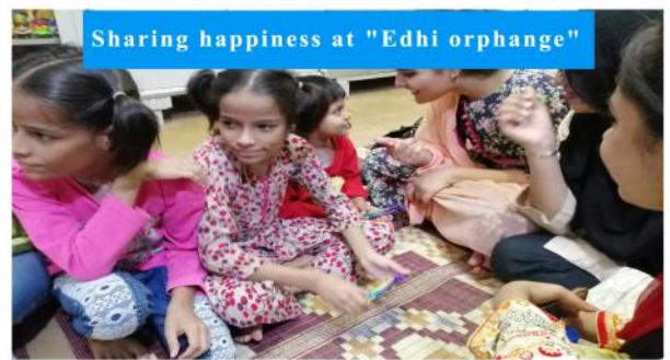
Sharing happiness at "Edhi orphanage"